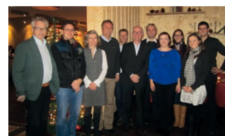
TAFISA friends at Christmas Dinner

Using the platform and framework of Designed To Move and the feedback from members as part of the TAFISA Member Survey 2013 (see Page 7 for more information), TAFISA will review its whole portfolio of programs, events and activities to streamline and enhance the delivery of services to our members. As part of its business development process over the coming months, and the resulting action plans for 2013 to 2017, TAFISA will focus on offering tools to empower our members to break the cycle of physical inactivity, particularly in the critical target group of children under 10 years of age. Stay tuned to exciting developments!