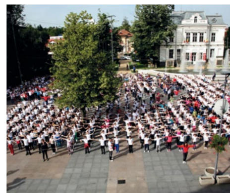
WCD in Pitesti, Romania

Promoting physical activity in urban spaces is a great commitment, and TAFISA encourages all cities and communities around the globe to continue their efforts towards a more Active World.