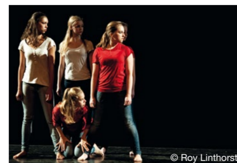
Intermezzo by young dancers of the pre-school for the School for Performing Arts of Enschede