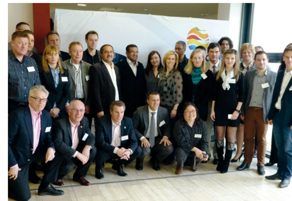
The SportCityNet first project meeting in Wiesbaden, Germany

Supported by the European Commission as part of the 2012 Preparatory Action: European Partnerships on Sport, the TAFISA SportCityNet Project was launched in January 2013.