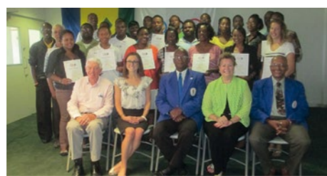
CLC St Vincent and the Grenadines