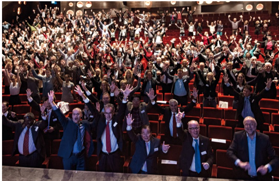
Opening Ceremony of the 23rd TAFISA World Congress 2013, Enschede, Netherlands

Sustainability is at the very core of Sport for All and physical activity (SAPA). It is a key element and cornerstone of any successful and enduring Sport for All program or policy. However, in the rush to deliver programs and the fight to create popular policy and maintain power, sustainability is often overlooked by shortsighted governments and SAPA organisations alike. The time is ripe for us all, as leaders of the Global SAPA Movement, to recognise and reinforce the critical importance of sustainability in Sport for All and physical activity.