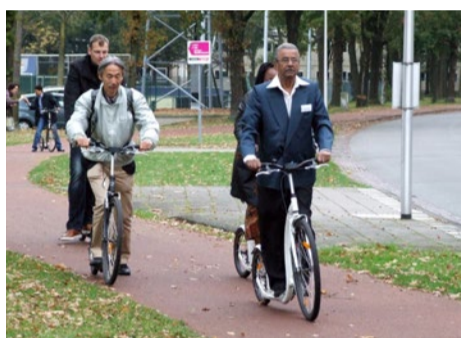
An ecological way of commuting at the Enschede Congress field trips.

(cont. from Page 1) The World Commission on Environment and Development, in its Brundtland Report, famously defined sustainable development as “development that meets the needs of the present without compromising the ability of future generations to meet their own needs”. John Elkington further developed this concept by recommending that profit should be measured not only by financial value, but other social and environmental factors, and introduced the concept of sustainability’s Triple Bottom Line, or 3Ps: People, Planet Profit.