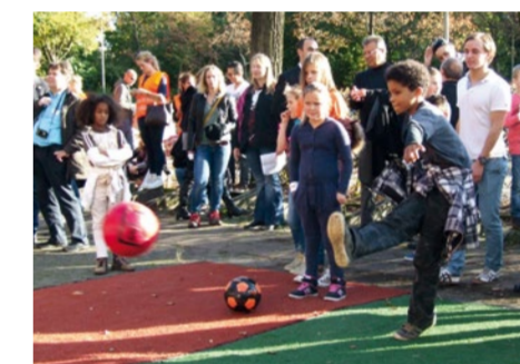
A football activity at the 3rd checkpoint of the walk.

Beautiful weather for an exceptional event: on Saturday 26 October, Congress participants got the opportunity to meet with the local population along a stunning 7km route in the streets and park trails of Enschede. In total, more than 400 people gathered on the City Hall Square and started the cultural and scenic walk that took them through different physical activities at several checkpoints installed along the way. TAFISA thanks the City of Enschede for organising such a successful event.