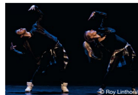
Intermezzo by Flowmotion